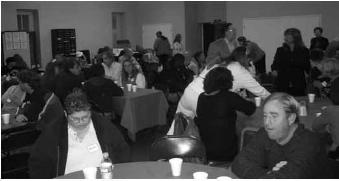
Last year's Christmas Party

NAMI North Coastal will hold its annual Christmas party for clients and family members on Thursday, December 10, from 6-9 PM.